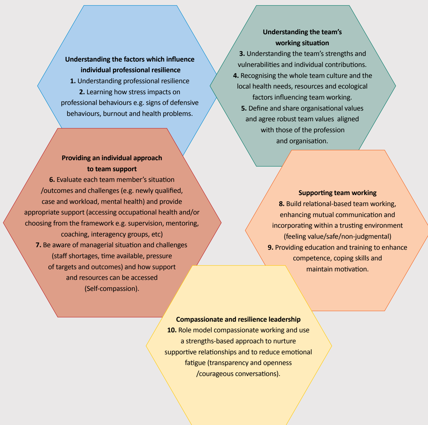
Figure 3: 10 steps for managers to create supportive environments and build resilience with their staff

Given the plethora of concepts and resources available, the following diagram sets out ten steps to assist managers and team leaders to gain a rounded picture of the individual and team context of resilience.