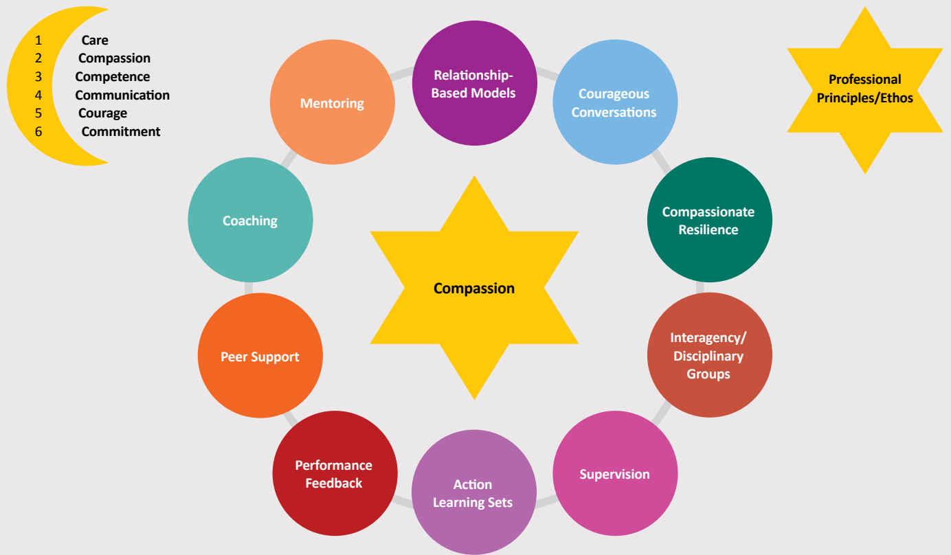
Figure 2: The Resilience Framework